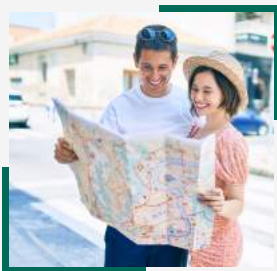
Travel Insurance by Mafpre Insular