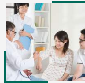
Home Service on Laboratory and Diagnostic Tests by Hi-Precision Diagnostics