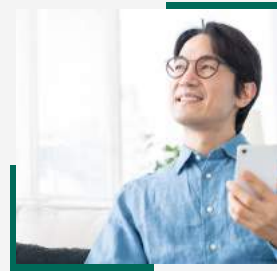
Life Insurance powered by Insular Life